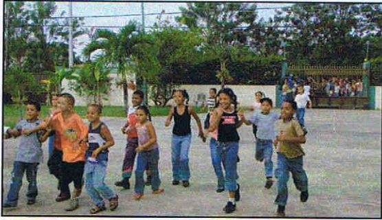
350 children filed through our gate last Saturday,