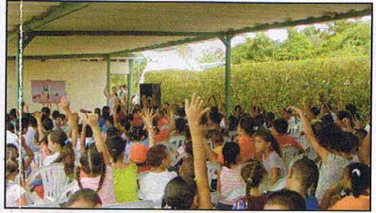
I shared the story of Ruth, an ancestor of Jesus Christ. Almost every hand was raised when I invited the children to pray to receive Jesus and ask God to use their lives to make a difference in this world.