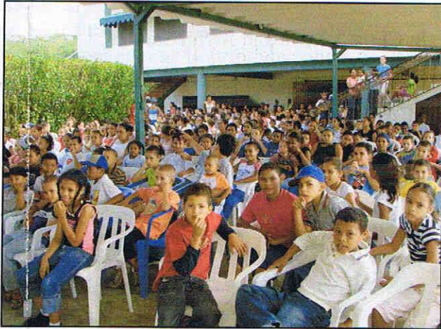
filling our carport, driveway and porch to overflowing.