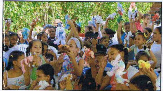
Then we distributed the gifts, which brought great joy!