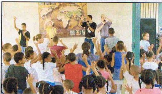
We worshipped God in song...